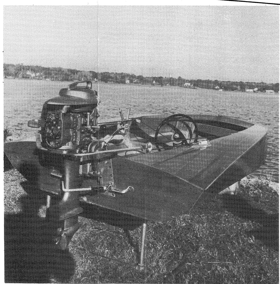
18. Already to run. I prefer to have my carrying handles close, so they can double as hold downs for my motor. Right back of the lower unit is my drain hole for running in marathons.